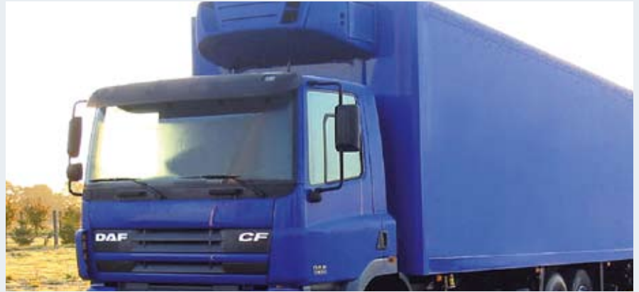
M.KO motor container