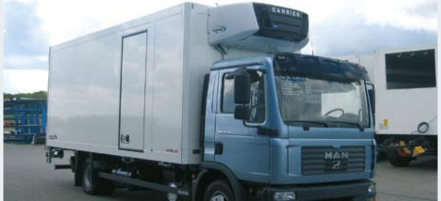
M.KO motor container